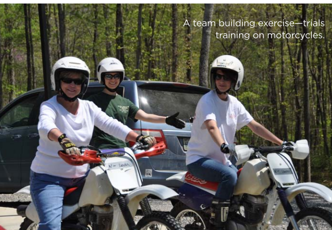
A team building exercise—trials training on motorcycles.

“I just want people to enjoy working here. We want it to be a good place,” Nix says. “We’re growing very quickly and providing a good service. I love coming to work and I think everybody else does, too.”